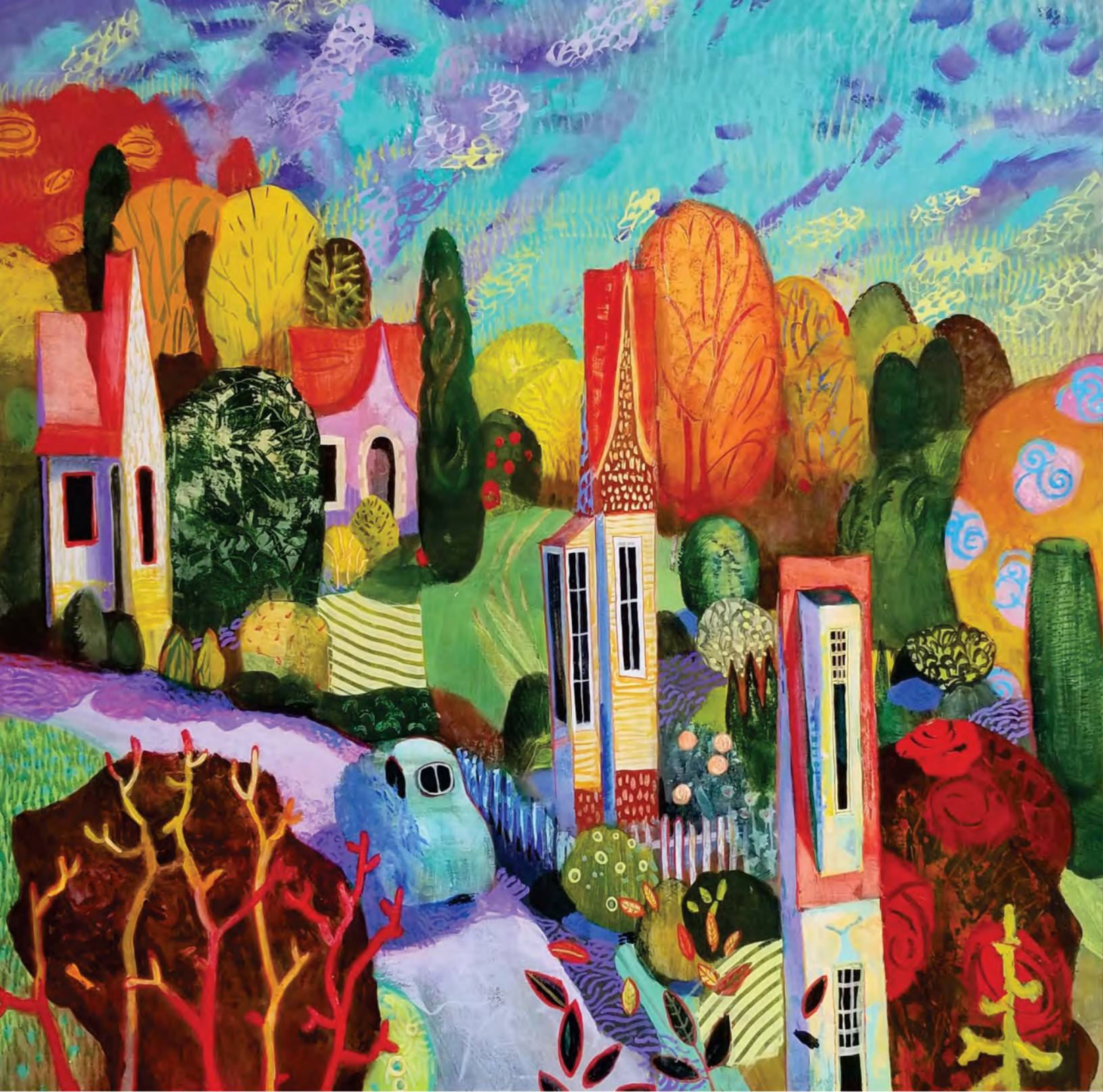
Above, The Long Staircase , acrylic on canvas, 36" x 48"