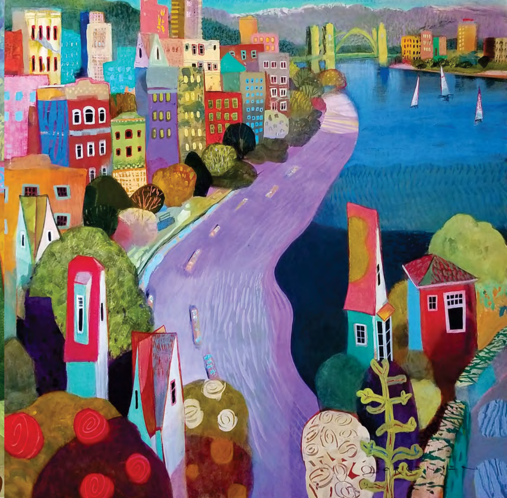
Following Page, English Bay , acrylic on canvas, 36" x 36"

Paul reflects, "My studio, which I built in 1987, is in our back garden so I am surrounded by lovely greenery and calmness. I like to imagine a story about the painting as I work, while at