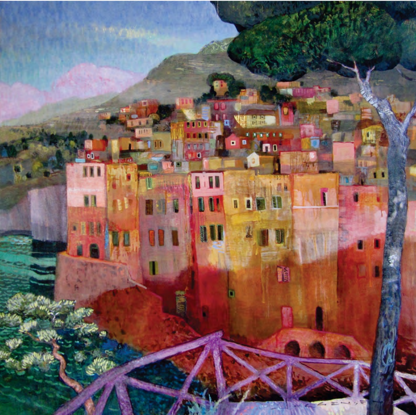
Below, Return to Riomaggoire , acrylic on canvas, 36" x 36" Following Page, Torreone , acrylic on canvas, 40" x 30"

To anyone starting out as an artist, Paul advises, "Just keep at it. The more that you do, the more that you learn. Lots of times, I have found a painting that really strikes me. I study it to find out what it is that attracts me, and then try to use that one piece of information, technique, perspective, colour or whatever and apply it to my painting...or at least attempt to.