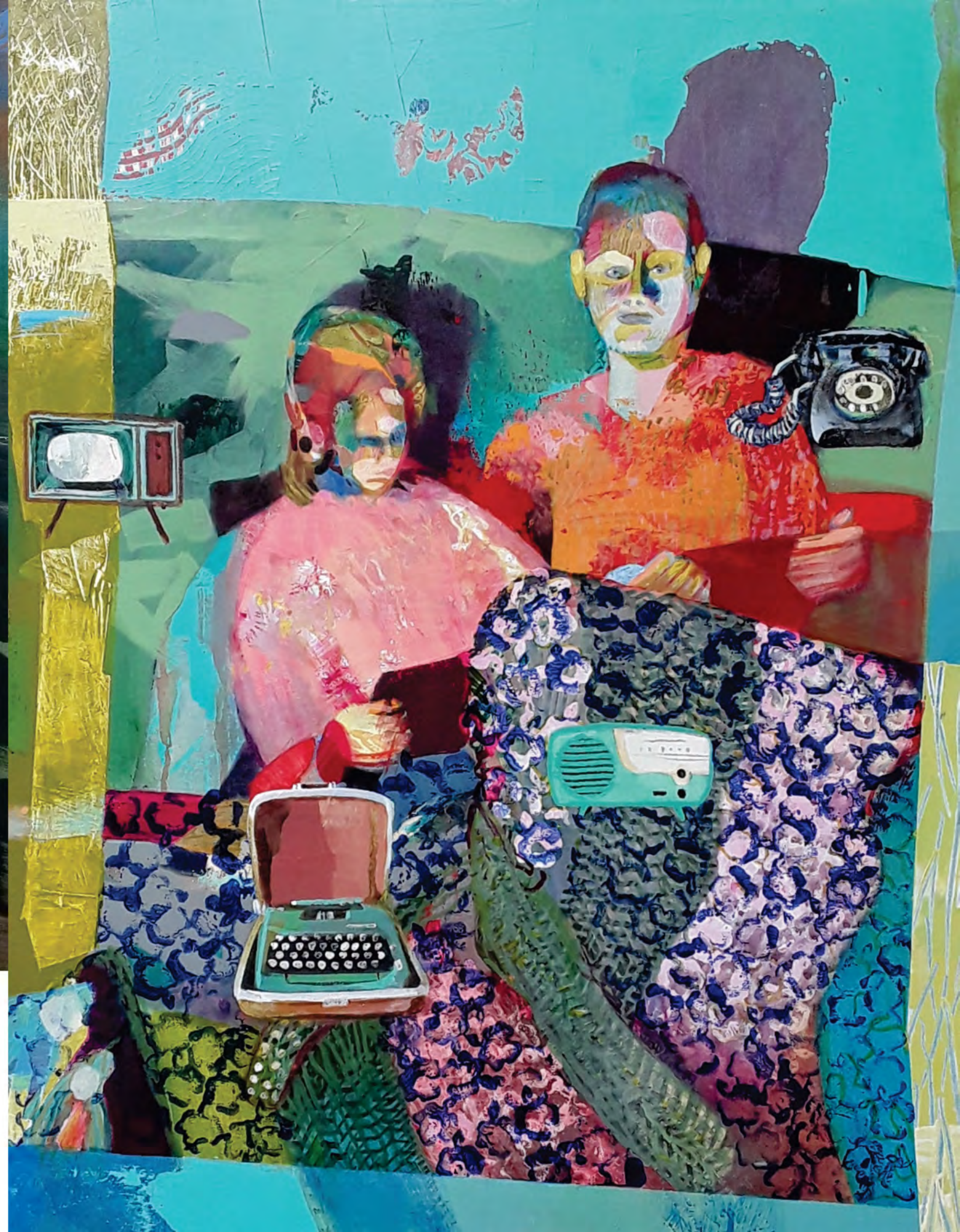
Previous Page 1, The Filberg Stairs , acrylic on canvas, 36" x 36" Previous Page 2, We are Home , acrylic on canvas, 36" x 36" Above, Going to Town , 1947, acrylic on canvas, 24" x 24" Following Page, Communication , acrylic on canvas, 36" x 30"