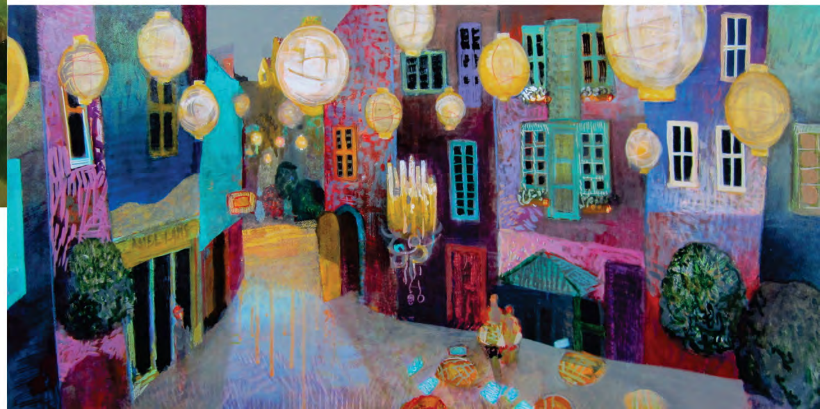
Above, Sanoma Searching , acrylic on canvas, 36" x 36" Following Page: top, The Long Staircase , acrylic on canvas, 36" x 48" bottom, Niel's Yard , acrylic on canvas, 18" x 36"