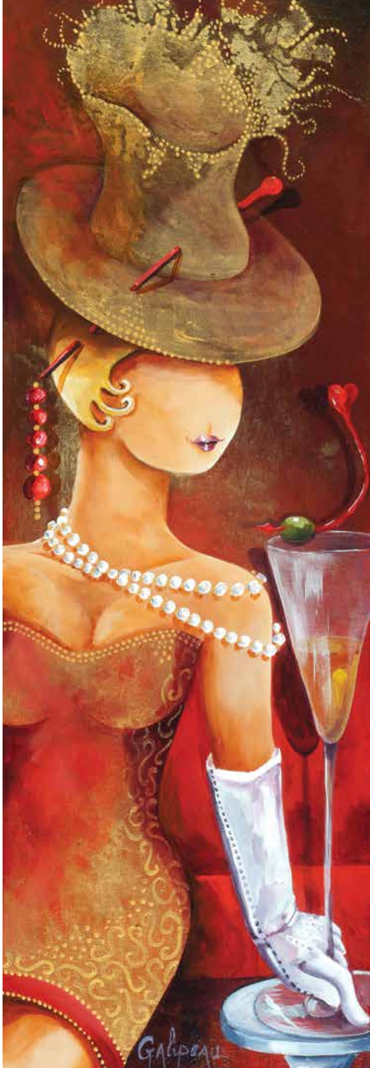
left, La Demesure, acrylic, 36" x 12"