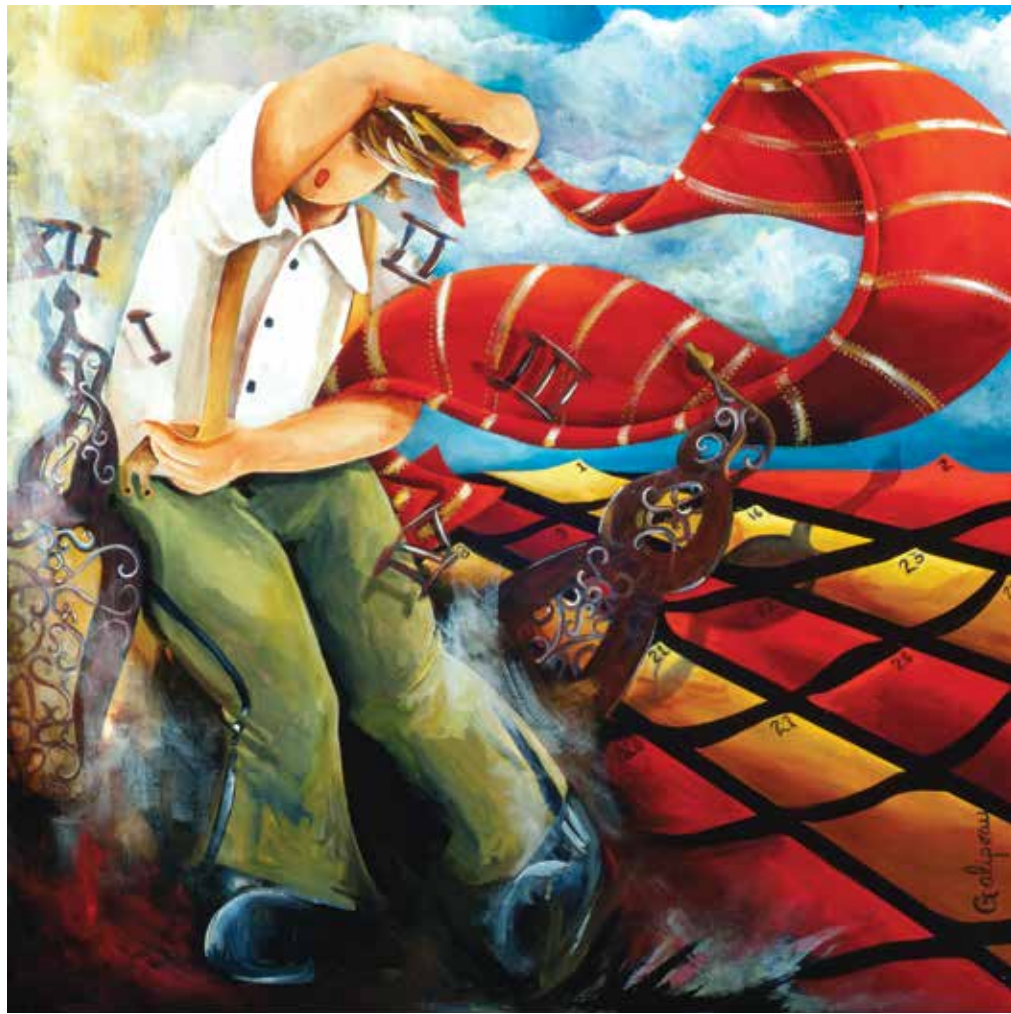
previous page, Ma Lumiere Interieure, acrylic, 24" x 30" above, Jouer Avec Le Temps, Jouer Avec Le Vent, acrylic, 40" x 40" right, Gagner Sur Tous Les Plans, acrylic, 30" x 30"

paint. Suddenly, a dark star-filled sky will jump out at me, or a park bench or the silhouettes of an embracing couple. It might sound mysterious, perhaps even a bit crazy, but a voice inside of me guides me to the end of the painting."