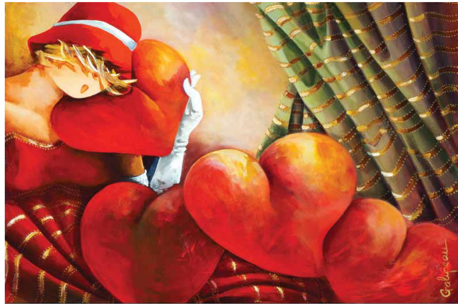
above, Ecouter Son Coeur , acrylic, 24" x 36" left, Le Temps De Te Dire , acrylic, 48" x 24"