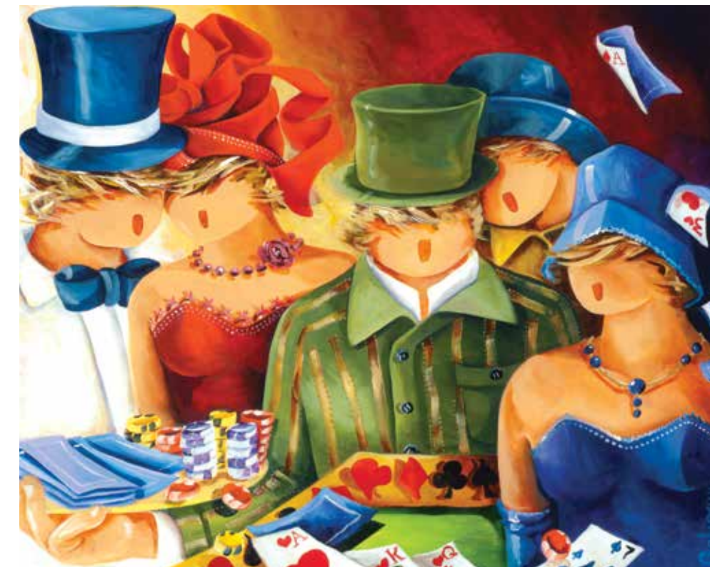
above, A Votre Service, acrylic, 24" x 30" left, Complicite, acrylic, 24" x 24"

immediately," he recalls with a smile, "but after several attempts, Multi Art was seduced by my work and they agreed to show my paintings on a trial basis in order to judge the reaction of their clientele. The very date of my fortieth birthday, Multi Art finally gifted me a permanent position on its team! From that day forward, I have been represented by a dozen significant galleries across Canada!"