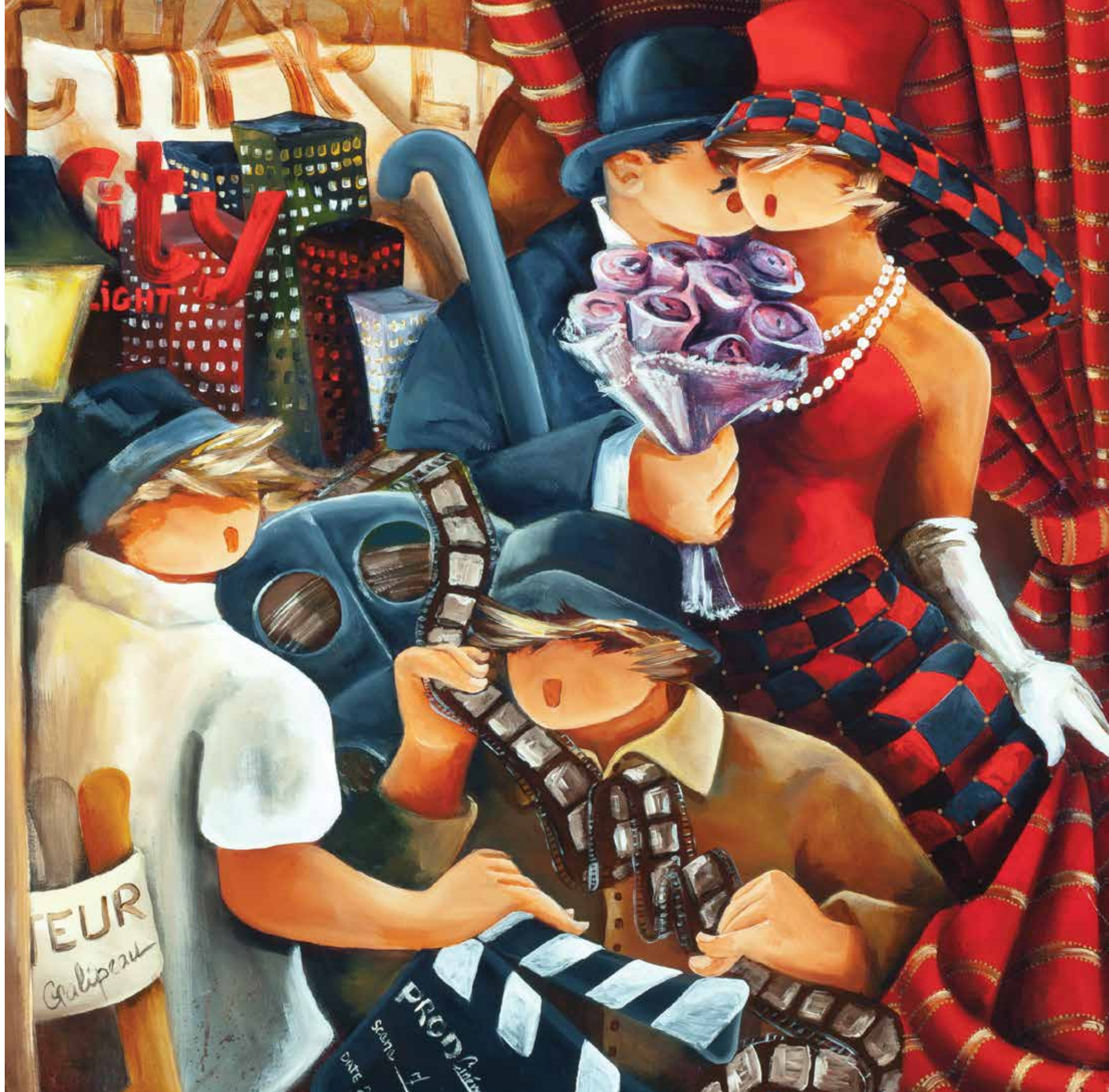
right, Cinema, Cinema, acrylic, 40" x 40"