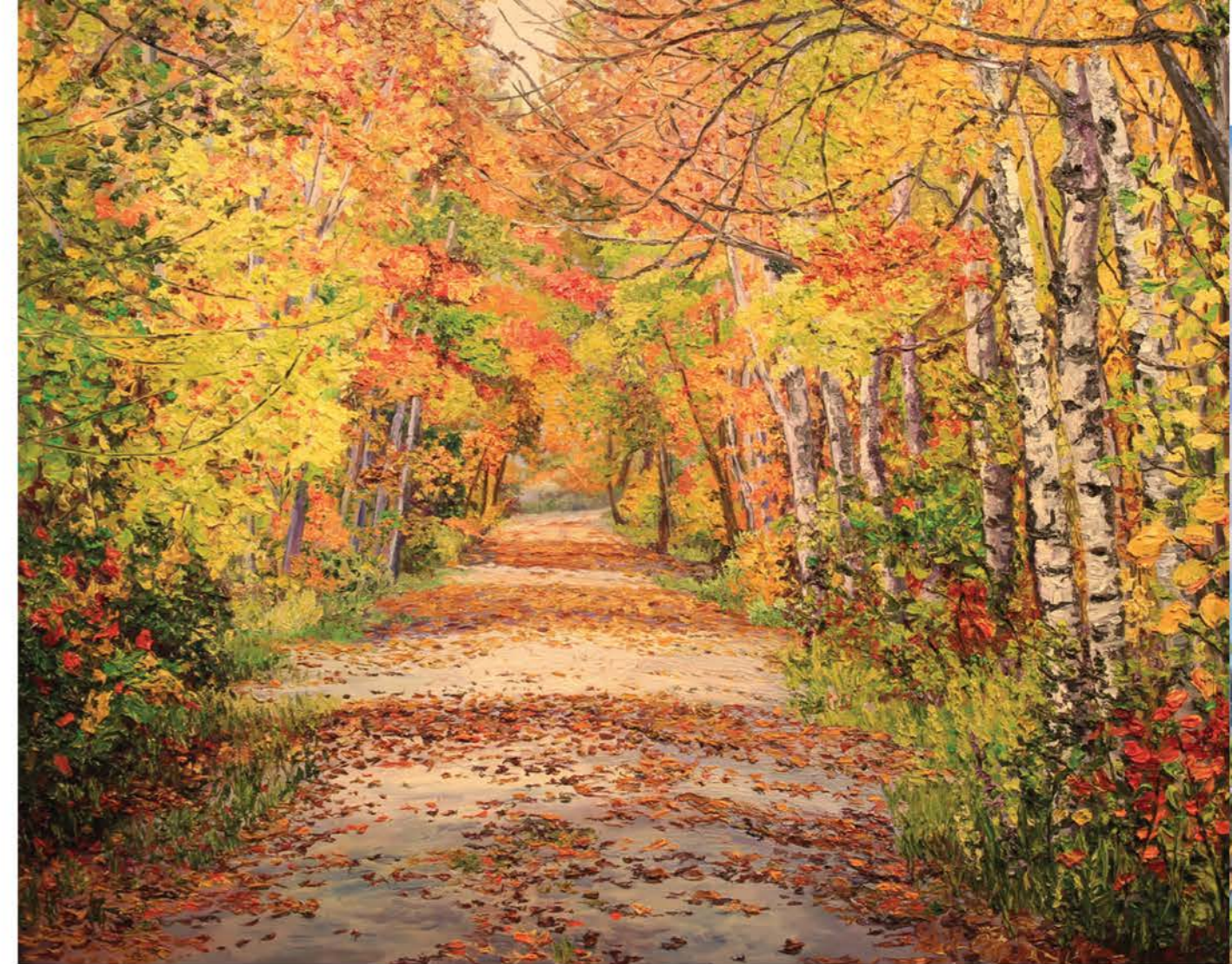
Previous Page, Summer's Glow, oil on canvas, 60" x 108" This Page, left, Autumn Serenade, oil on canvas, 60" x 48" above right, Thornbury Trail, oil on canvas, 48" x 60"

worked in the fishing industry in Nova Scotia and contributed to the Chamber of Commerce, and the Business and Professional Women's Organization.