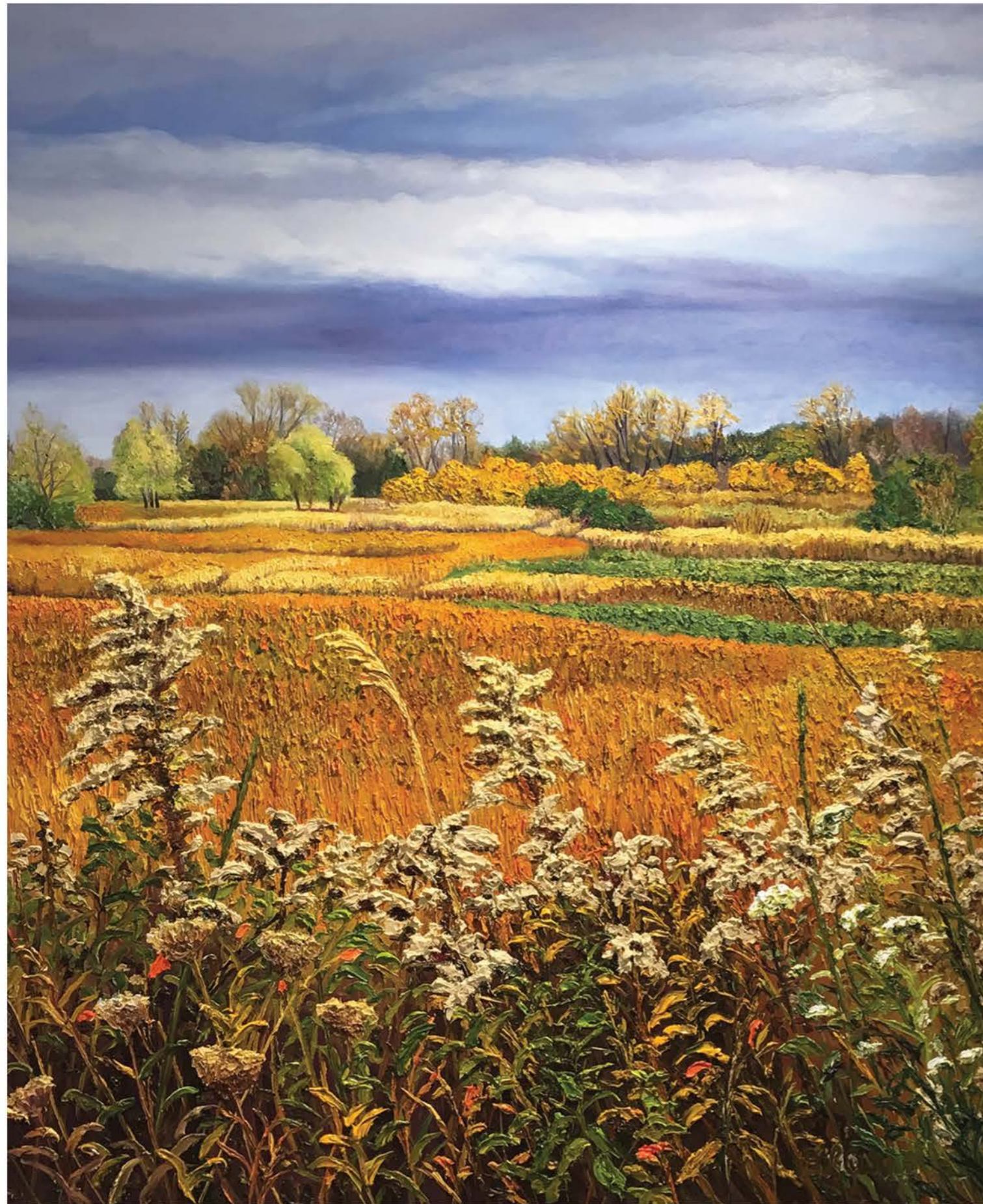
Previous Page, left, The Far Side , oil on canvas, 40" x 30" right, Summer Day Dream , oil on canvas, 48" x 36" This Page, left, Golden Dreams , oil on canvas, 60" x 48"

involved, exhibiting exclusively there and painting with other artists on site.