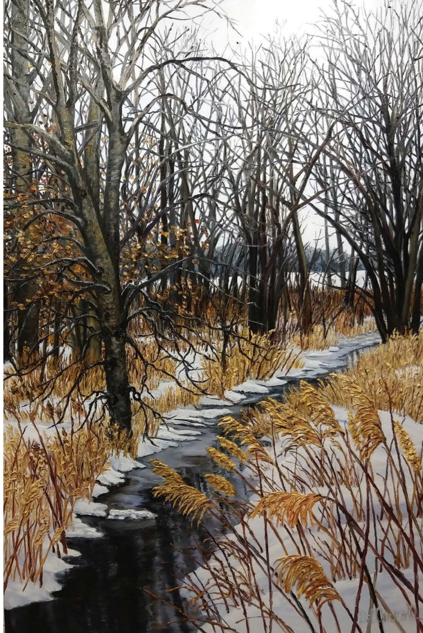
Previous Page, left, The Four Season's , oil on Canvas, 40" x 30" right, Ode to a Tree , oil on canvas, 40" x 30" This Page, left, Reflections of Winter , oil on canvas, 72" x 48"