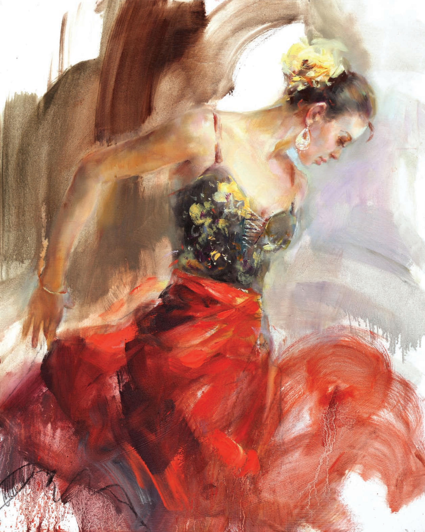
Splendor Dance 1, oil on canvas, 24" x 30"