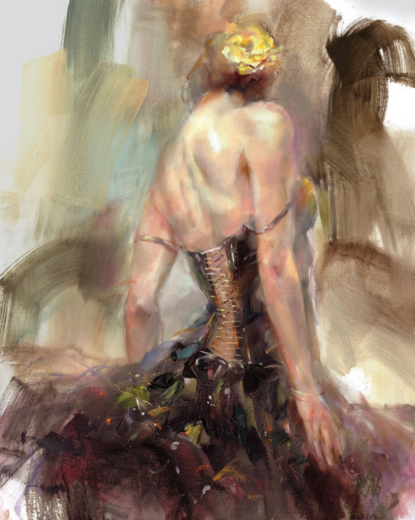
above, Dance Power 2, oil on canvas, 24" x 30"