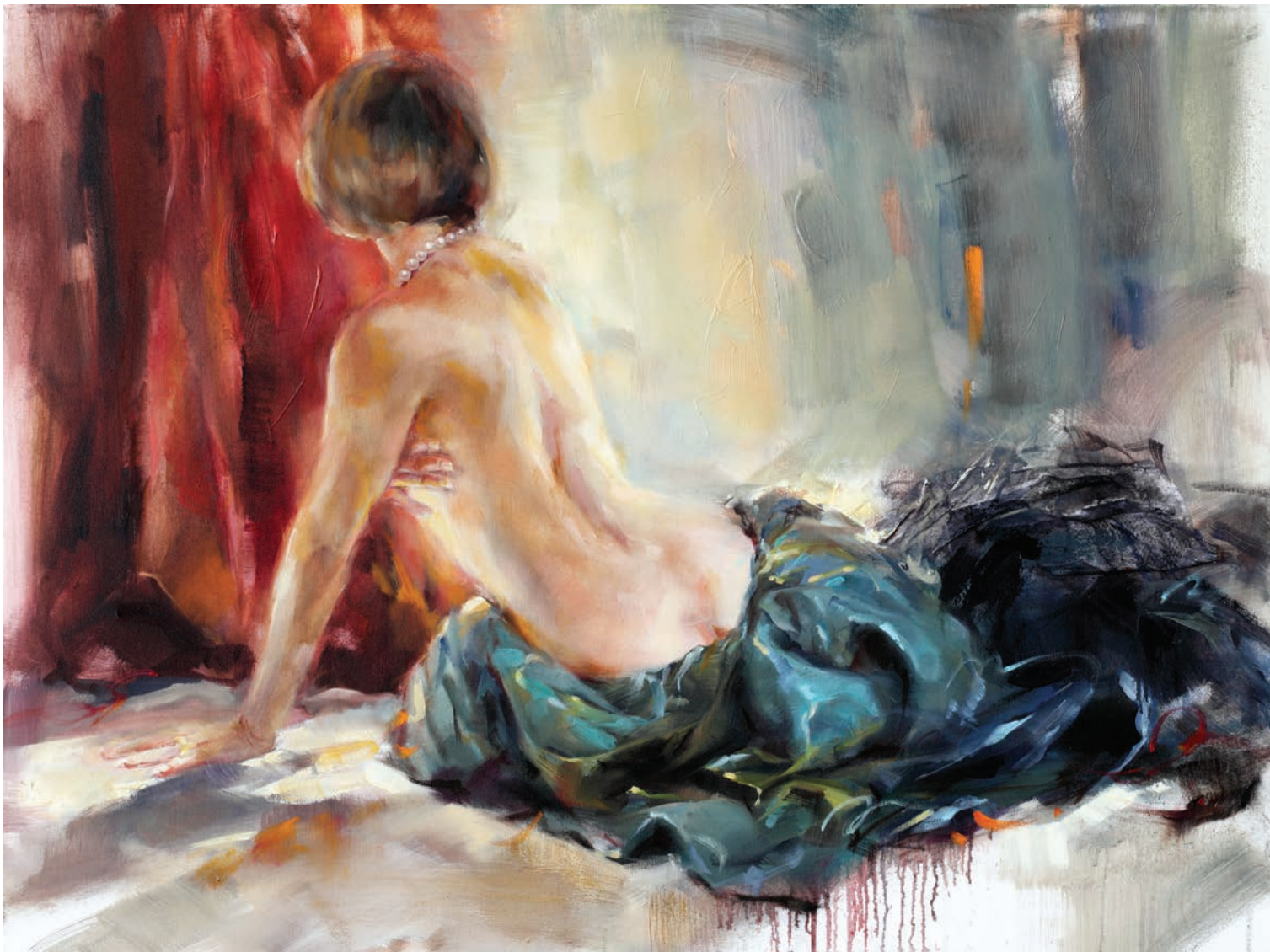
Longing 2, oil on canvas, 40" x 30"