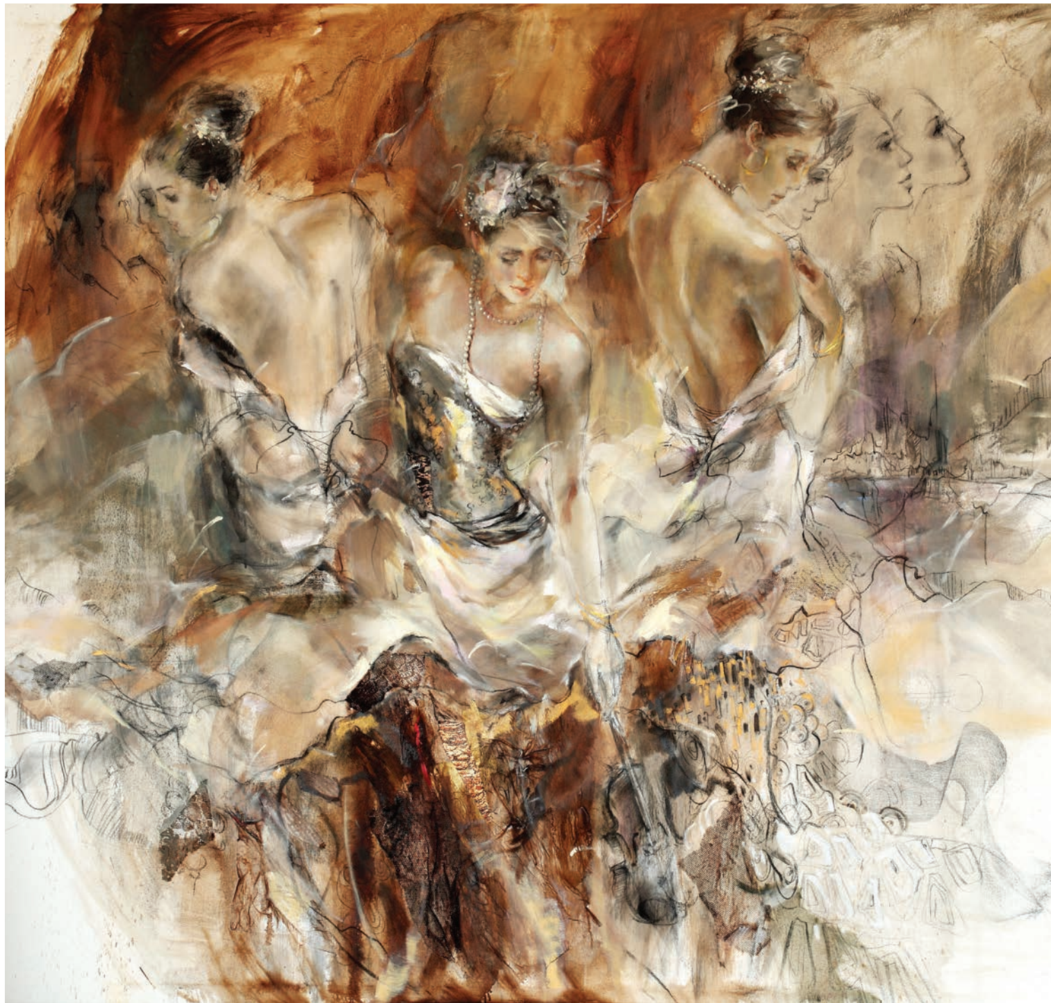
above, Past. Present. Future. (sepia study), mixed media on canvas, 80" x 72"