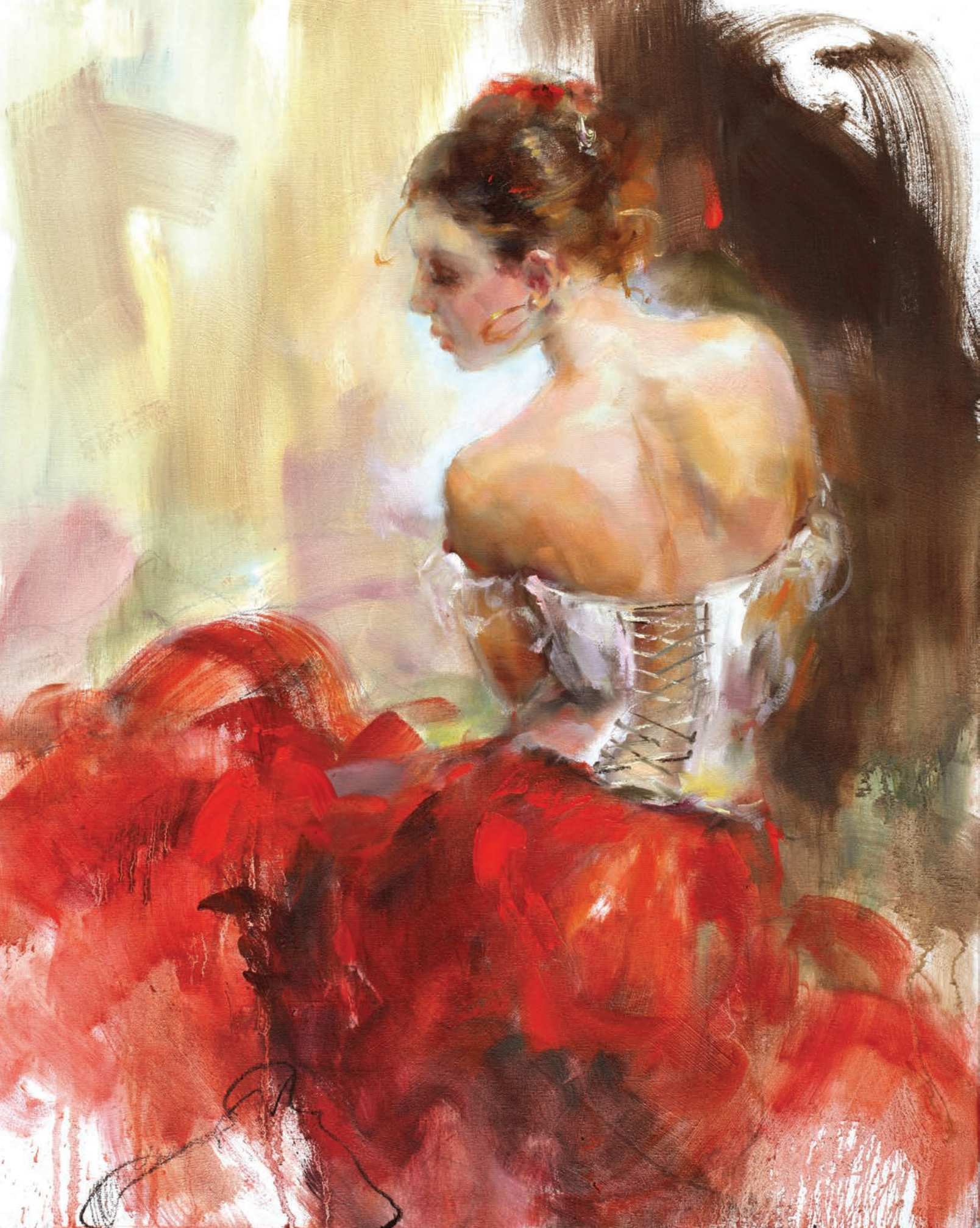
Splendor Dance 2, oil on canvas, 24" x 30"