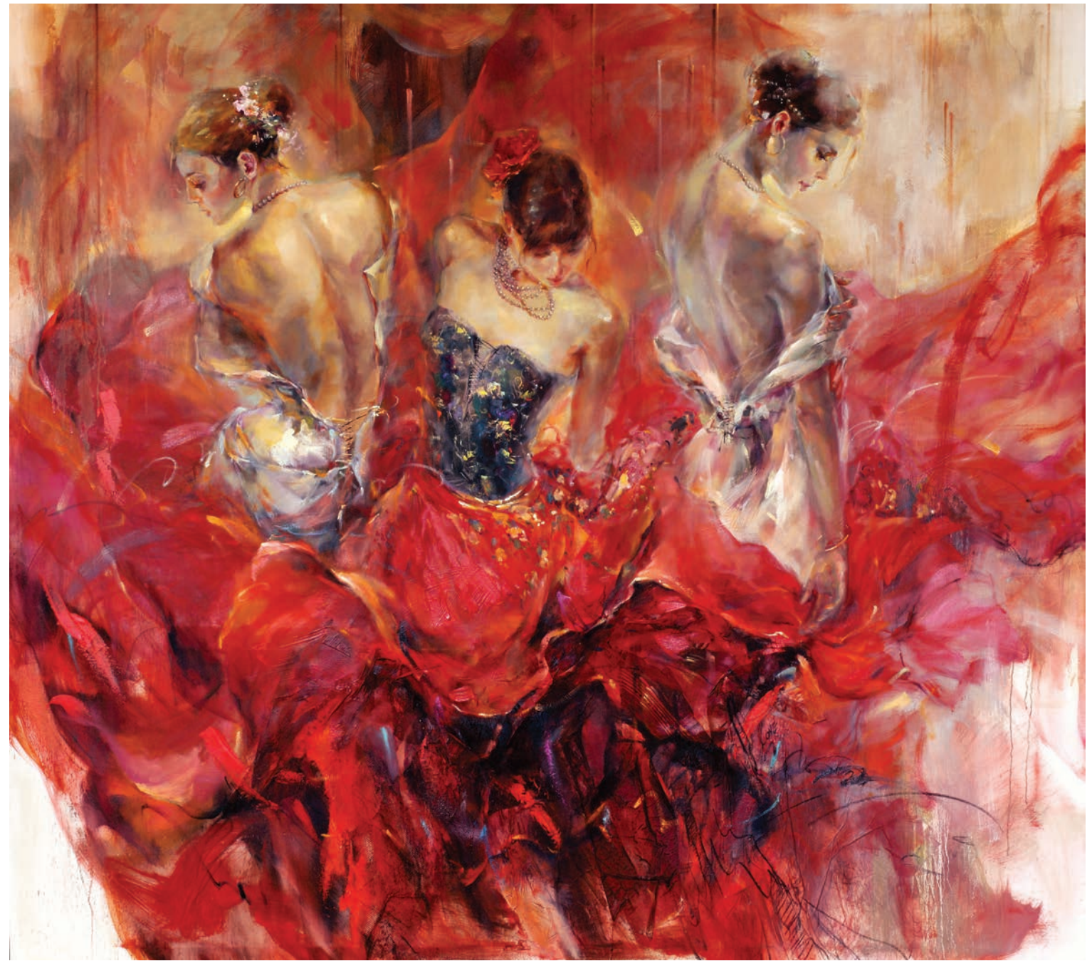
left, Aurora In Red, oil on canvas, 24" x 48"