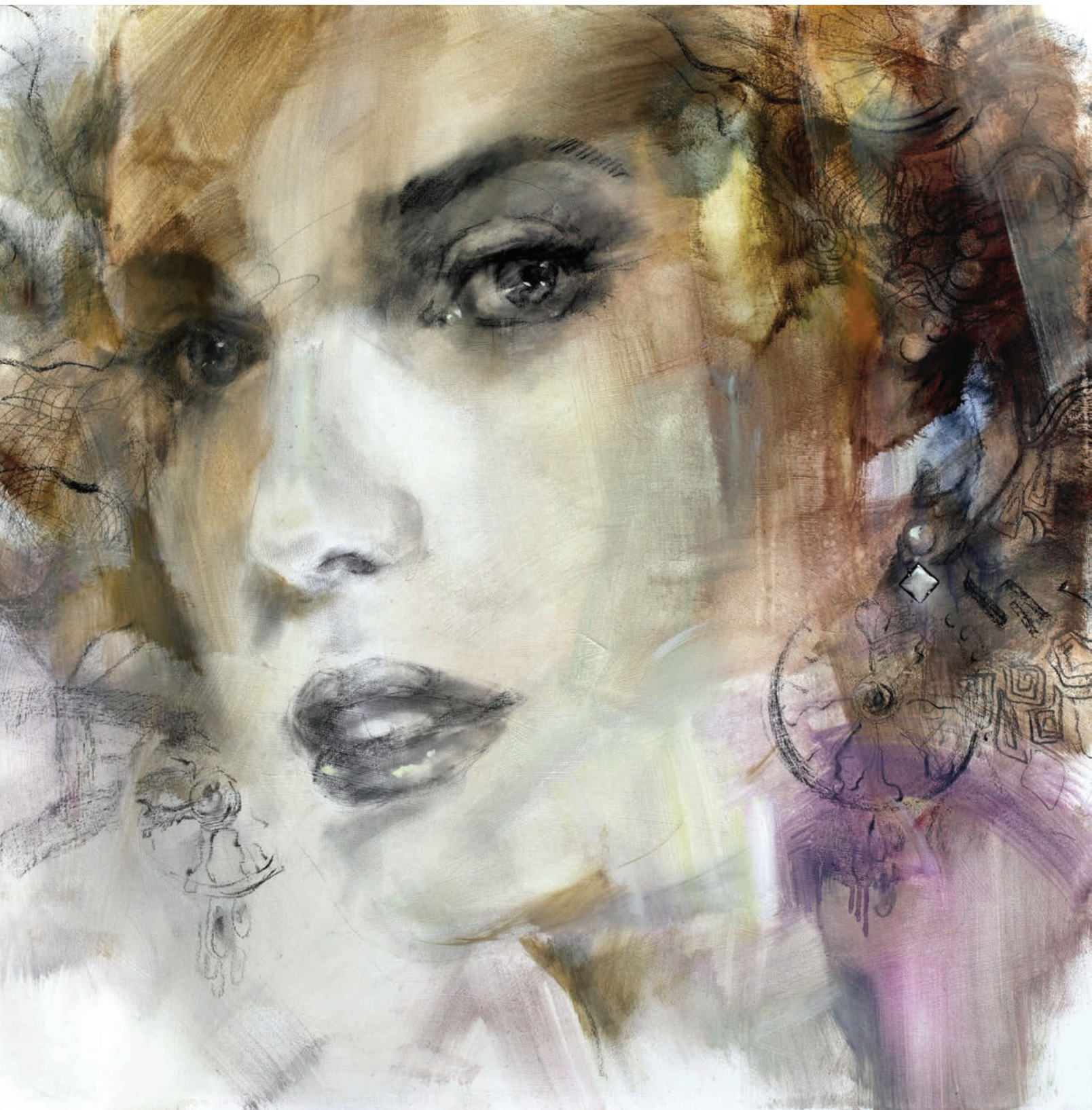
Captured Memories 3, mixed media on canvas, 30" x 30"