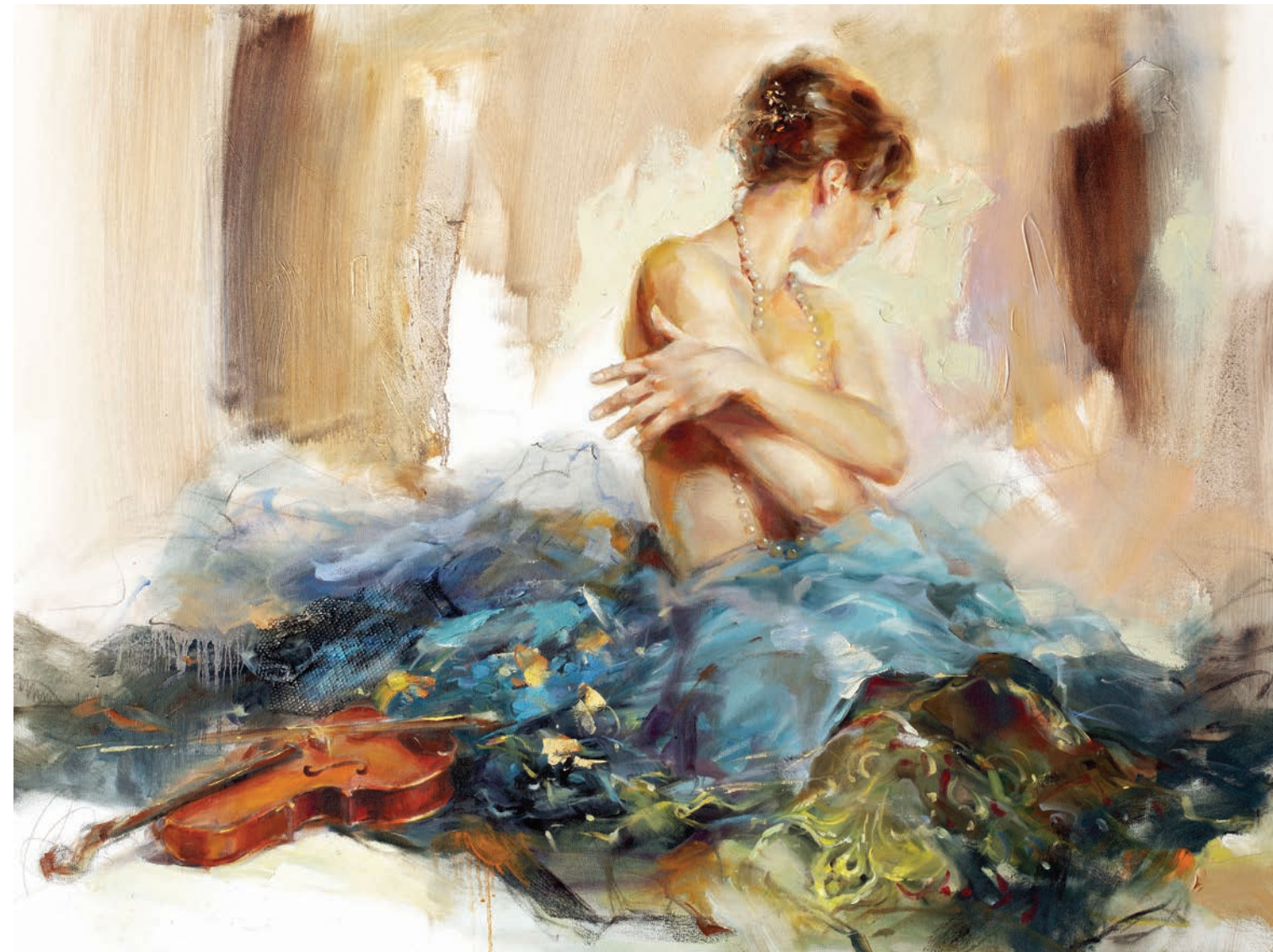
Prelude, oil on canvas, 40" x 30"