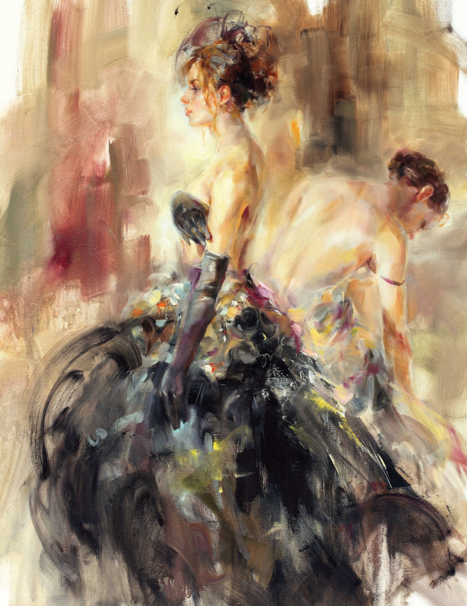
left, Parisian Nights, oil on canvas, 40" x 60"