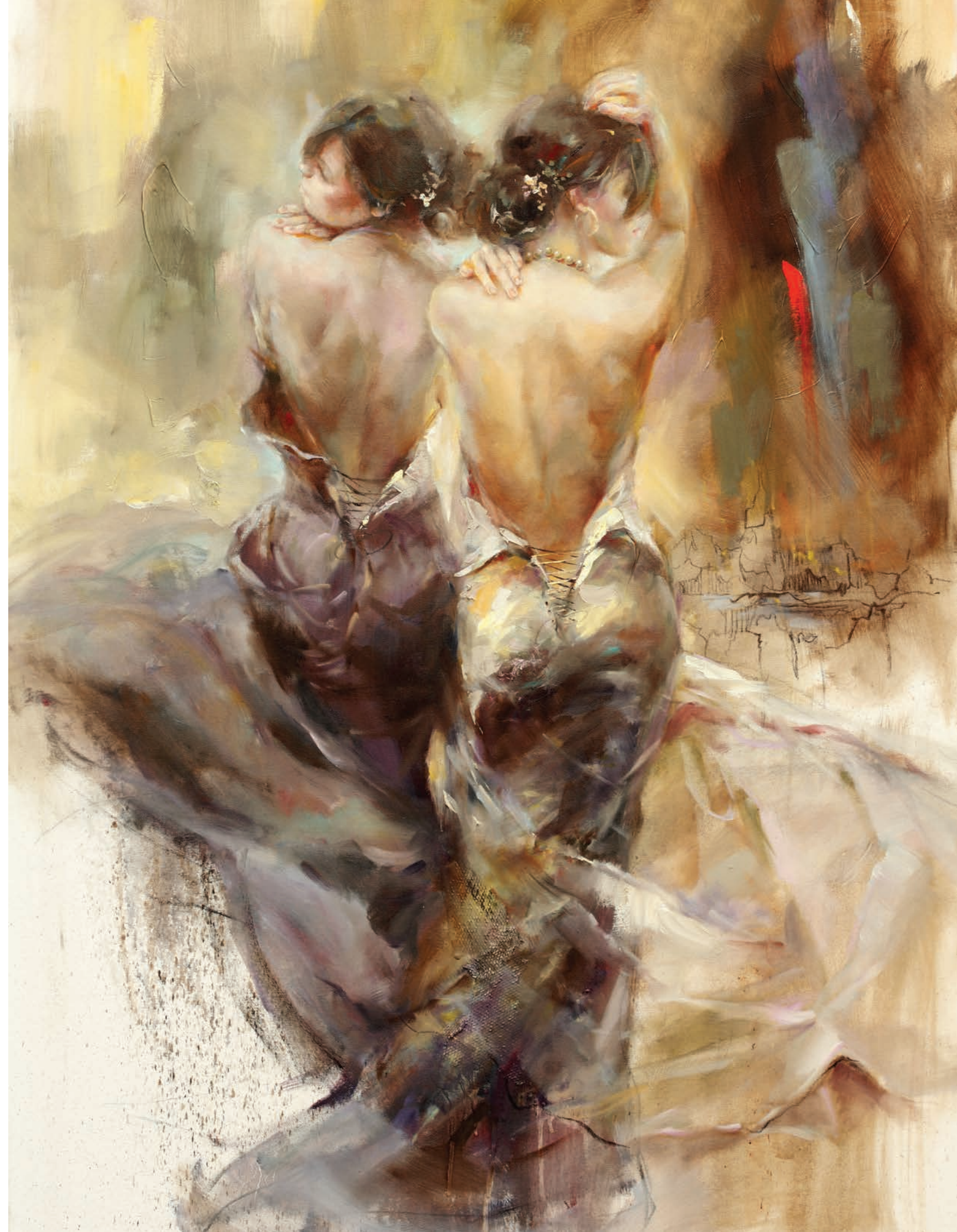
right, Forgotten Town, oil on canvas, 36" x 48"