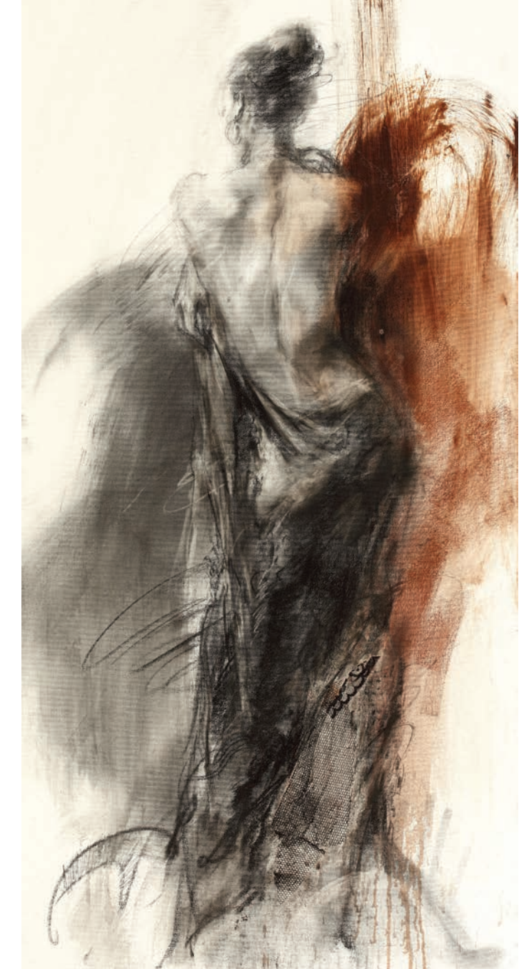
left, Midday Shadows, mixed media on canvas, 36" x 36" above, Aurora 1, mixed media on canvas, 24" x 48"